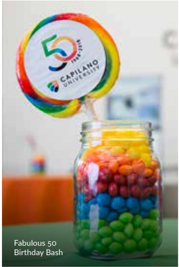
Fabulous 50 Birthday Bash

Over the past year, CapU has enthusiastically marked its 50th anniversary. From the Fabulous 50 Birthday Bash to CapFest to the Legacy Canoe, there have truly been some shining moments.