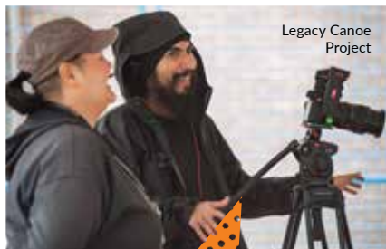
Legacy Canoe Project