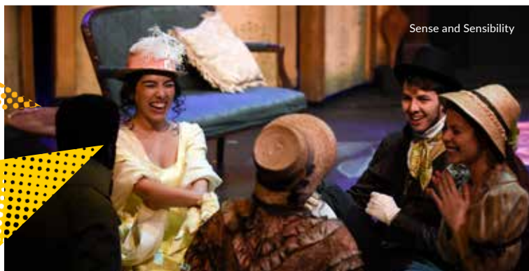
Sense and Sensibility