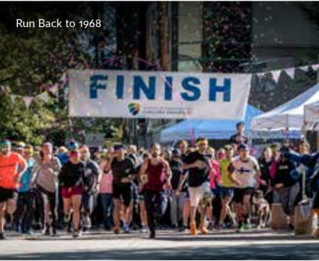
Run Back to 1968