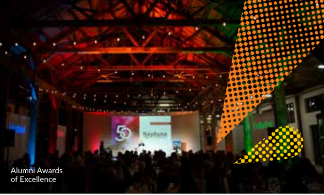
Alumni Awards of Excellence