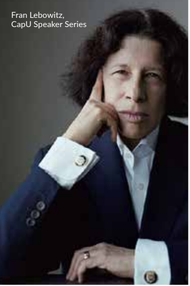
Fran Lebowitz, CapU Speaker Series