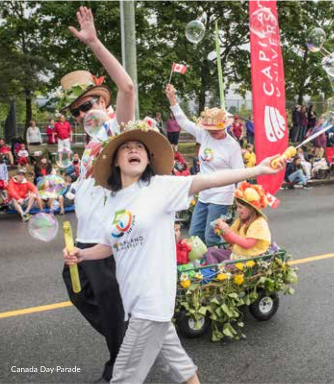
Canada Day Parade