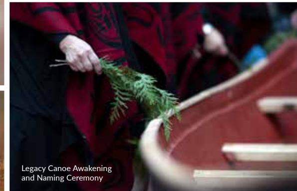
Legacy Canoe Awakening and Naming Ceremony