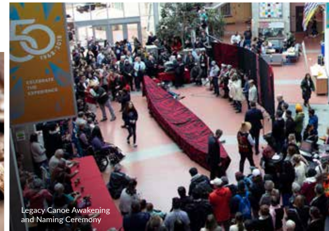
Legacy Canoe Awakening and Naming Ceremony