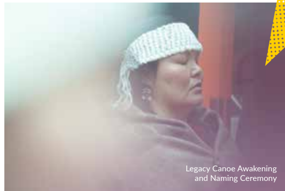
Legacy Canoe Awakening and Naming Ceremony