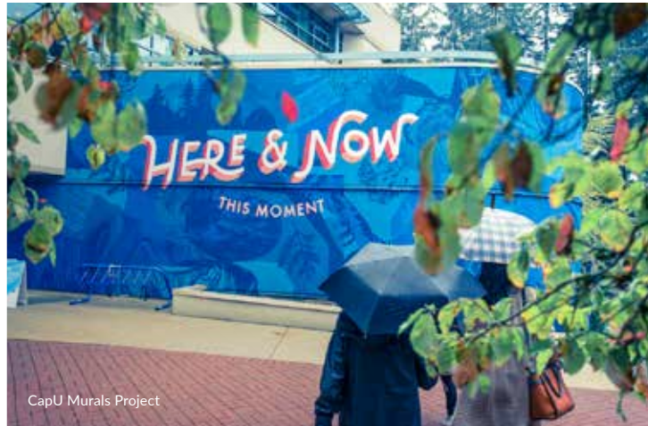
CapU Murals Project