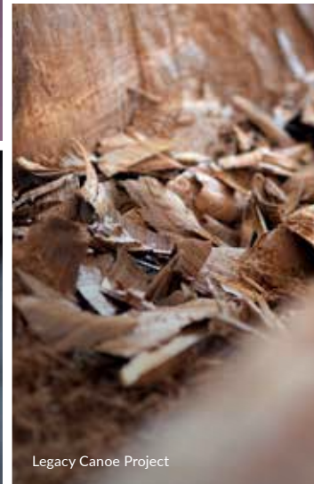
Legacy Canoe Project