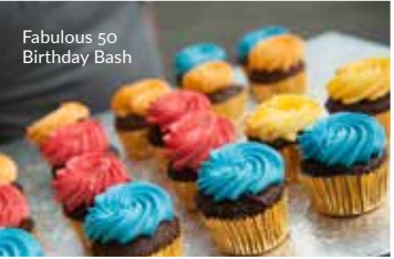
Fabulous 50 Birthday Bash