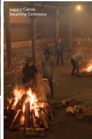
Legacy Canoe Steaming Ceremony