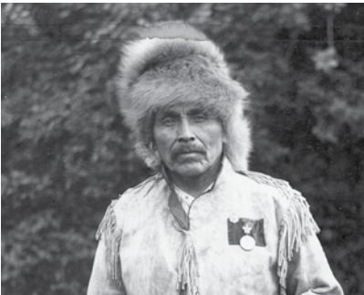
Capilano University was named after Chief Joe Capilano of the Squamish Nation.

The wings refer to the idea of aspiration and can allude to ravens, another local creature immortalized in First Nations mythology, associated with intelligence and creativity. The rocky base refers to the nearby Coast Mountains, which are a dramatic aspect of the local landscape.