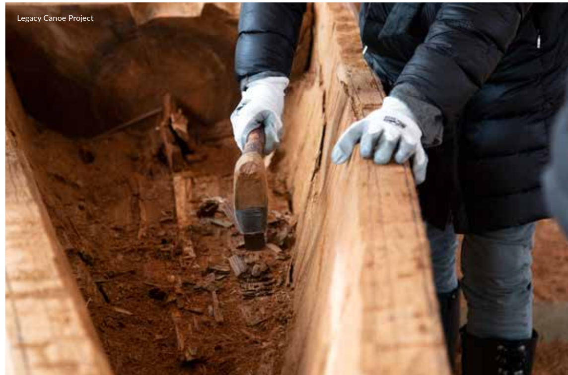
Legacy Canoe Project