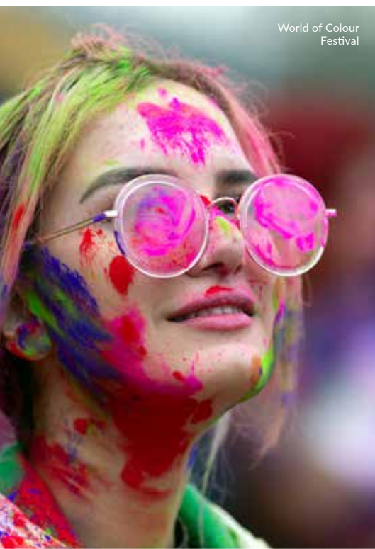
World of Colour Festival