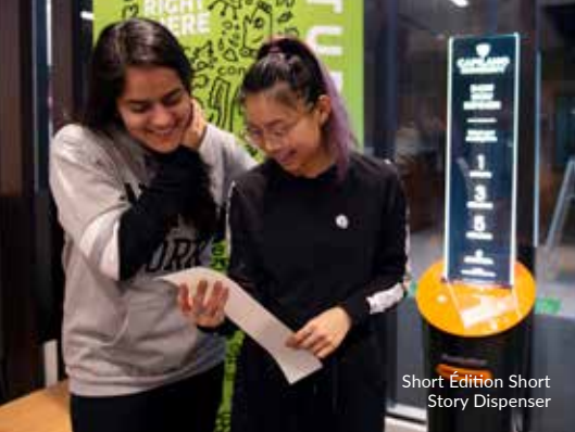
Short Edition Short Story Dispenser