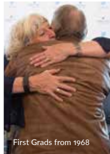
First Grads from 1968