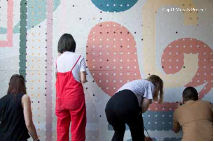
CapU Murals Project