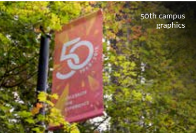
50th campus graphics