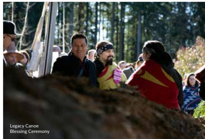
Legacy Canoe Blessing Ceremony