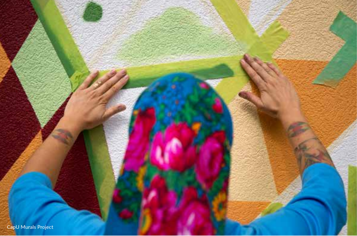
CapU Murals Project